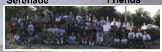
Dinner at Johnson's