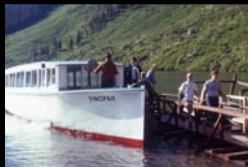
Boats of the Glacier Park Boat Company.