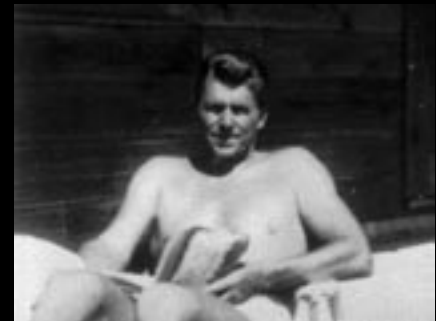
Dennis Weaver, Ronald Reagan and Victor Mature enjoyed “mugwumping” at Glacier Park Lodge while filming there in the early 1950s.